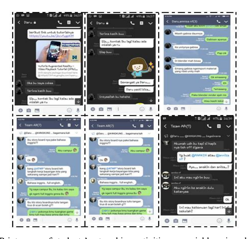
Figure B. Printscreen of students' networking activities on social learning platforms.