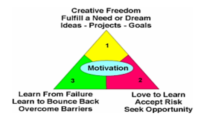
Figure 2. Elements of Motivation (Webb, 2006).