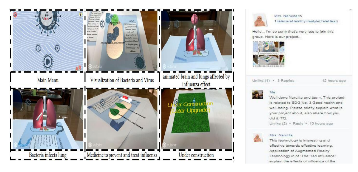
Figure A. Printscreens of Augmented Reality 3-D models on Edmodo social learning platform sub-theme 'Telecare and Healthy Lifestyle' (TeleHeal) with experience learnt to promote healthy lifestyledocumented on web in e-forum [https://www.edmodo.com/home#/group?id=13658913, http://bit.ly/telehealarticle1, https://seaaugmentedreality.wordpress.com/2018/01/31/project-proposal-announcement/]